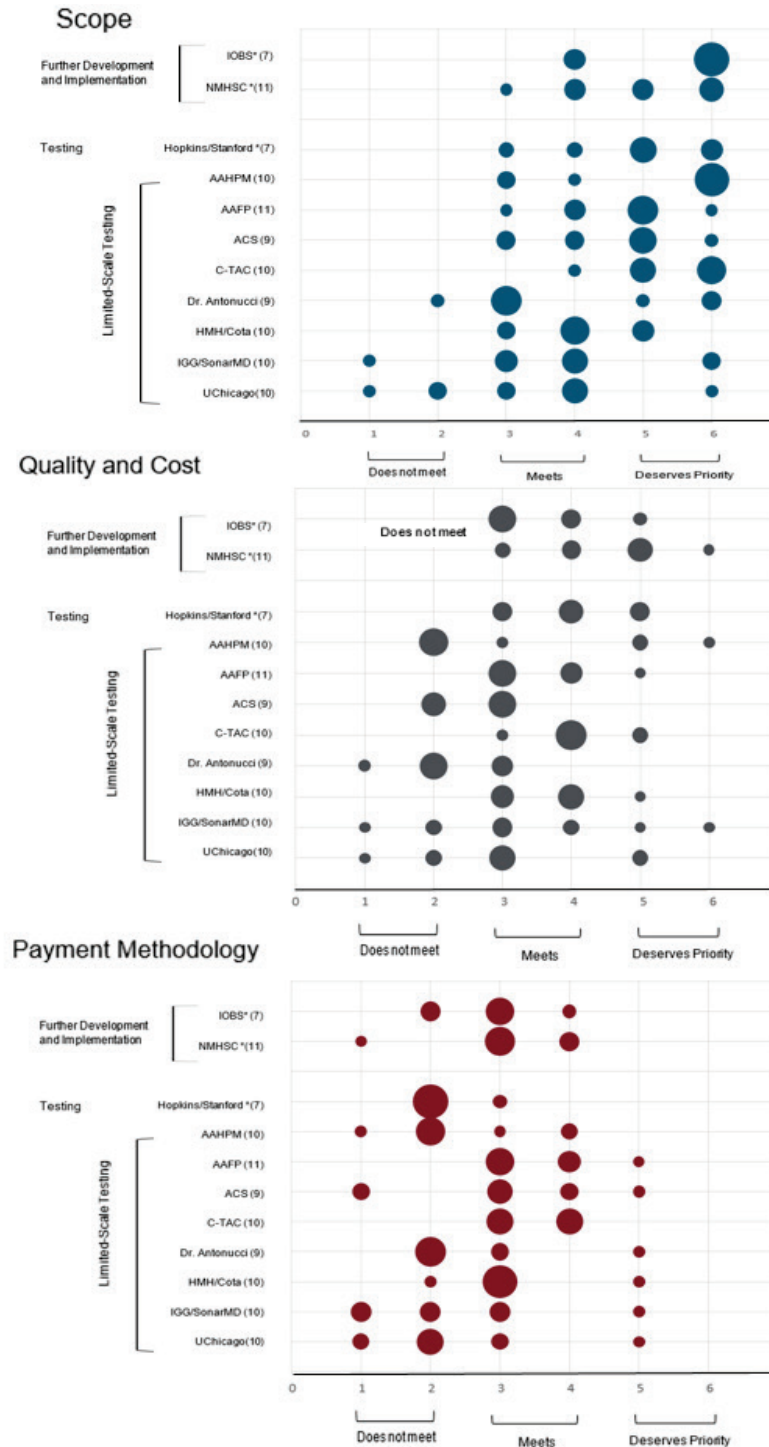
Exhibit 11: PTAC Voting on Priority Criteria: Models Recommended for Further Development and Implementation and Models Recommended for Limited-Scale Testing

NOTES: Bubble sizes represent the share of PTAC members voting for each score. Number of voters is shown after the proposal submitter name. Number of voters varies according to the number of PTAC members present and the number of PTAC members recusing themselves due to conflicts. Within each overall recommendation group, proposals are sorted alphabetically. *PTAC deliberated on three proposed models (Hopkins/Stanford, IOBS, and UNMHSC) under a new voting approach that was approved in September 2018.