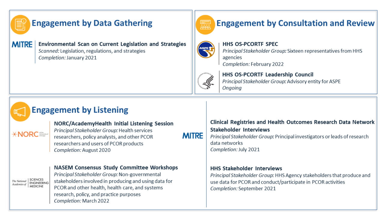
Figure 4. Foundations Informing Strategy Development